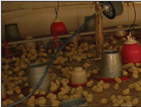
Figure 4. Chick behavior under different environmental conditions.

Chick behavior when environmental conditions are correct. Chicks are spread evenly throughout the brooding area.