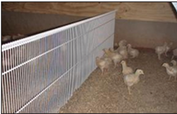
Figure 2: Example of a migration fence.

Migration fences ( Figure 2 ) installed at 30 m (100 ft) intervals, creating pens of equal size, will help maintain an even stocking density throughout the house. Fences should be installed as soon as birds have access to the whole house. Solid migration fences should not be used as they will restrict airflow.