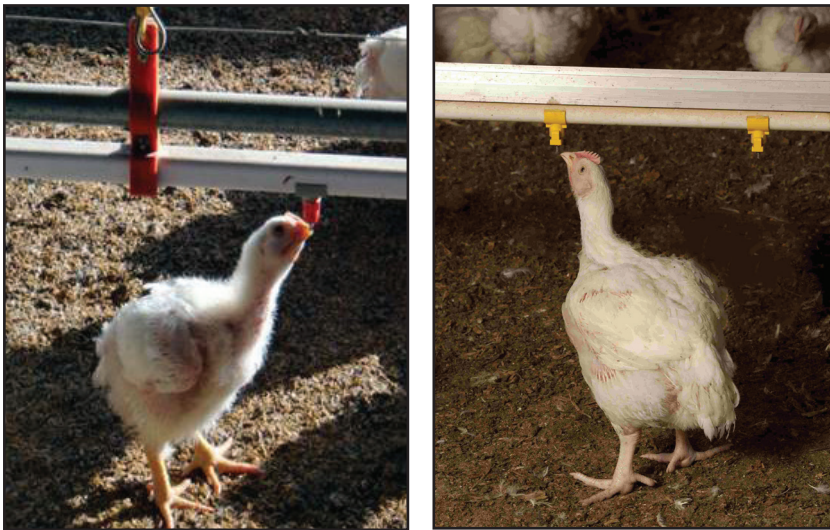
Figure 3: Correct nipple drinker height adjustment with bird age.

The ideal water temperature for chicks is 18-21°C / 64-70°F (Table 4).