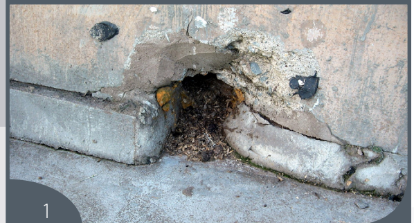
1 Burrows in house foundation.