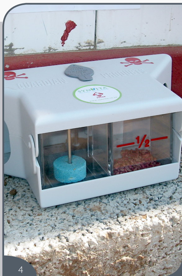
4 Bait station placed near an outside wall.